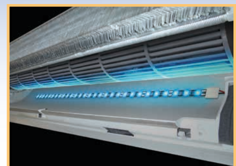
Mini UV LED inhibits mold growth, extends mini-splits life, and is quick & easy to install.