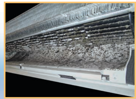
Mold thrives on mini-split blower wheels